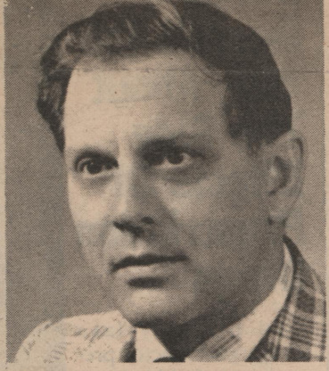
Raymond E. Fowler: Renowned investigator says UFOs defy capture.

Top investigator unearths close encounters that pierce U.S. defense system